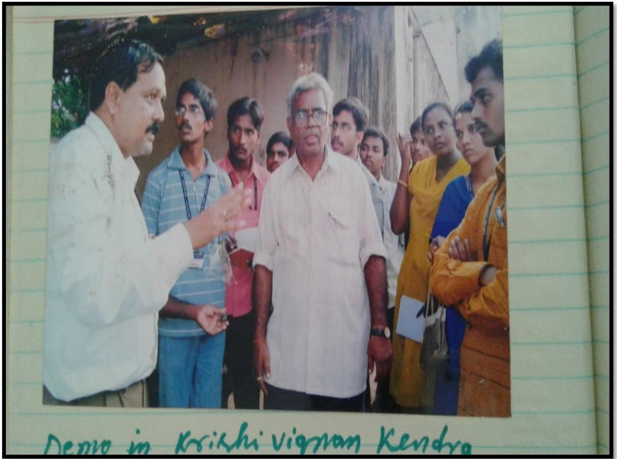
Demo in Krikhi Vigyan Kendra