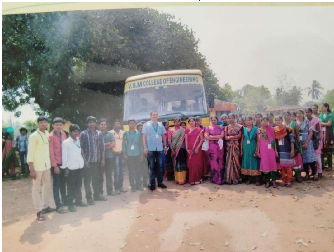
CENTRAL INSTITUTE OF FISHRIES EDUCATION, KAKINADA